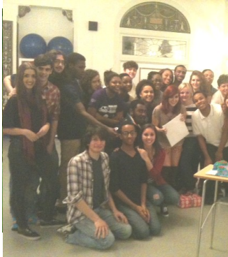
British students visited BSA for a week in the fall to begin work on the co-production — A new group will visit this year