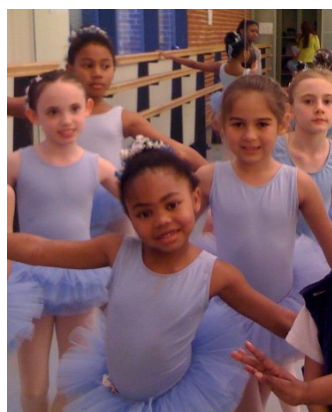
Bluebirds all ready to take the stage in Hansel & Gretel .

Many of the programs at Baltimore School for the Arts are made possible through contributions to the BSA Foundation, including 80% of the funding for TWIGS and all of the funding for college and summer scholarships, master classes and trips, performances and exhibitions, and so much more! We are grateful to our generous community for supporting BSA this year, and every year. You've helped to build an incredible school for our students, more than a thousand each year!