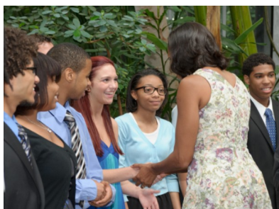
The First Lady greets BSA musicians after their performance in DC