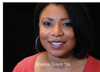
Shalita Grant '06