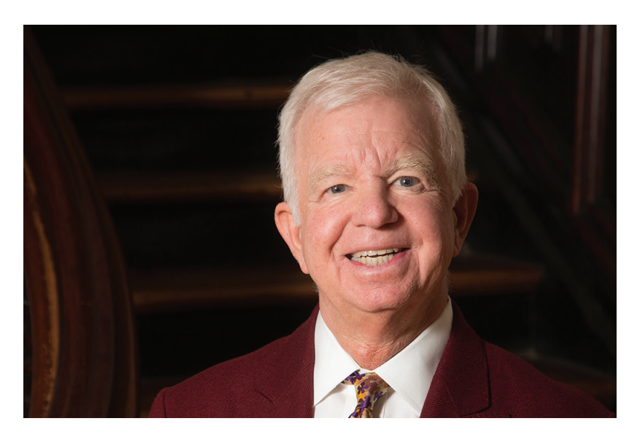
Dear Friend of BSA,

After visiting the Baltimore School for the Arts, I felt an instant connection. I saw immediately that BSA filled a niche in Baltimore City and I believe that the right school can change a young person's life. BSA gives children of every race and economic background the opportunity to explore their passion and to pursue training in the arts in a supportive and creative, yet disciplined environment. Whether they become artists or teachers or members of the business community, BSA provides them with a solid foundation and it is an incredible world for them in which to live.